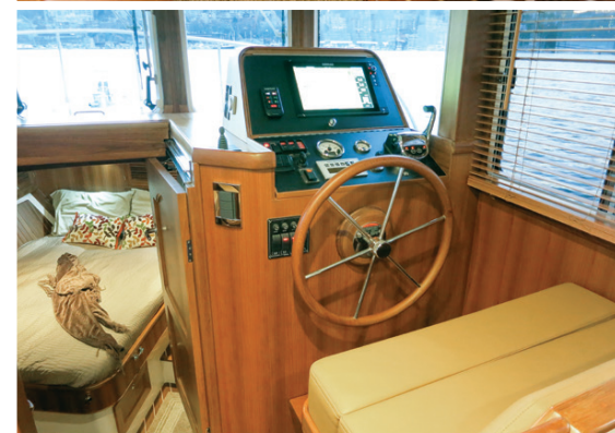
The new layout of the Camano 31, with the galley up instead of below and a separate shower space where the galley used to be, is far better for cruising boaters.